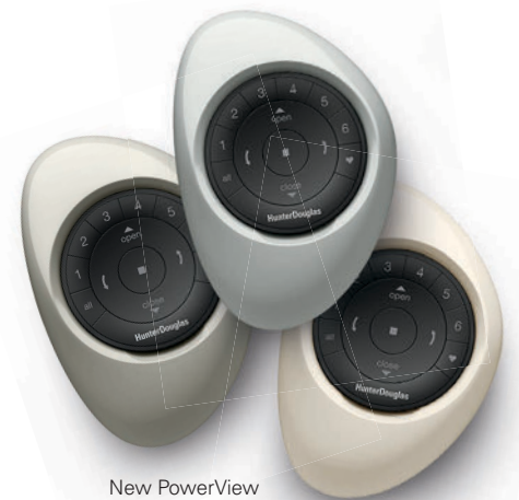
New PowerView Pebble Colors

Feature image: Silhouette® Window Shadings, Bon Soir™