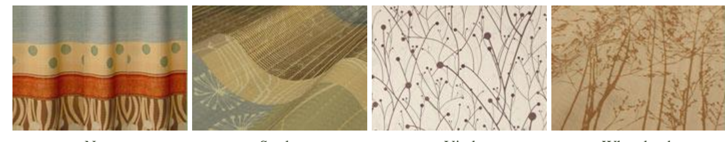
Meadow 27" V x 27" H