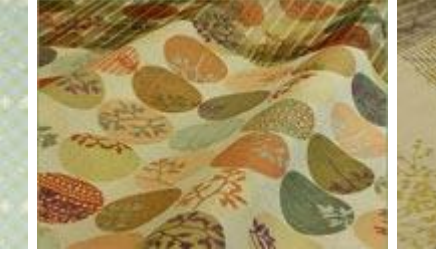
Illustration 7.5" V x 7.5" H