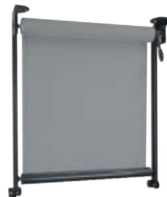
T2 shown here with cassette option.

Drop Shades can be fitted with an optional cassette hood that completely encloses the fabric for maximum protection from the elements.